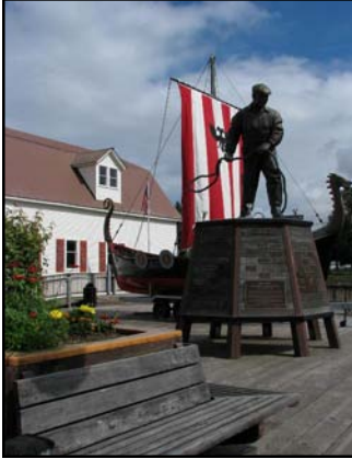
Norwegian Fishing Community

Your AM arrival in Petersburg will give you time to shop and get lunch on your own before tours start at 1PM. Tours include a visit to a local cannery (fish pending) and a walk in the local muskeg park with a good look at the local Bald Eagles. Tonight enjoy a traditional dinner at the Sons of Norway Hall, complete with local entertainment.