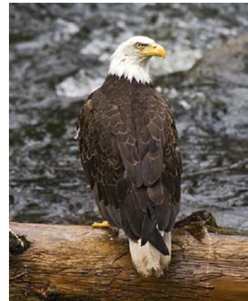
Sitka Raptor Center Tour

This morning we will arrive in Sitka, once the Russian Capitol of Alaska. Tours today will include The Raptor Center, The Native Cultural Center at Totem Park and Sheldon Jackson Museum. Later enjoy some shopping and time to explore a little more on your own. Stop by to visit St Michaels Cathedral, The Bishops House, or Castle Hill.