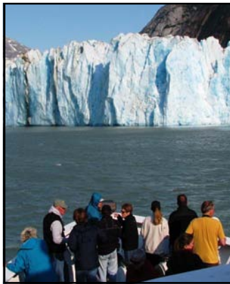
Up Close Dawes Glacier

This morning we will visit the Dawes Glacier. We will get as close as we can depending on the ice flows. Enjoy the beauty of this spectacular inlet with the chance to see whales, eagles, seals, or our resident Grizzly, Mr. Ford. Tonight we will enter the rarely visited Fords Terror. You will find yourself surrounded by steep hills and beautiful waterfalls.