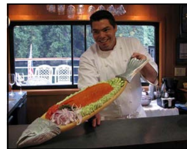
Chef prepared meals "Fresh Catch"

Contact your favorite cruise agent for an early booking discount today!!