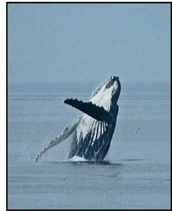
Breaching Humpback Whales

Heading North into Frederick Sound and Stephens Passage we will be looking for Humpback Whales as they feed in these local waters. If tides are good we may have a chance to visit the oldest lighthouse in SE Alaska. Our anchorage tonight will be in Endicott Arm near the Dawes Glacier. Watch Harbor Seals as they take rest on the many icebergs.