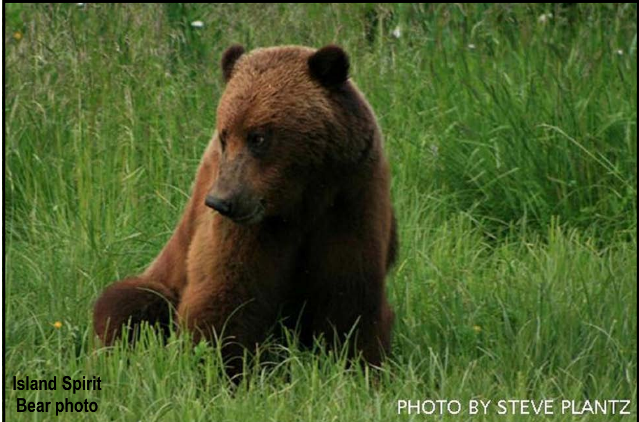
Island Spirit Bear photo