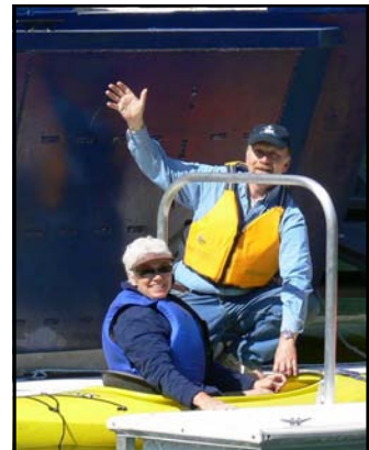
Special Kayak loading dock For safety and ease

Today we will relax and enjoy the solitude of our wilderness anchorage. Take out a kayak, enjoy an interpretive cruise in our skiff with the Naturalist or just sit back on a deck chair with your favorite book. No communication with the outside world today as we enjoy nature at its finest. The sound of waterfalls will lull you to sleep tonight.