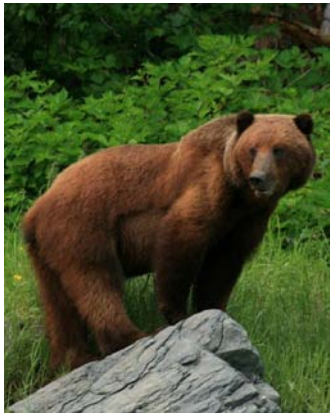
Alaskan Brown Bear